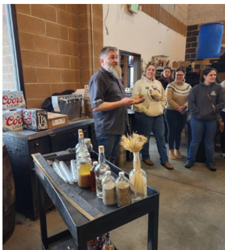
New Basin Distillery