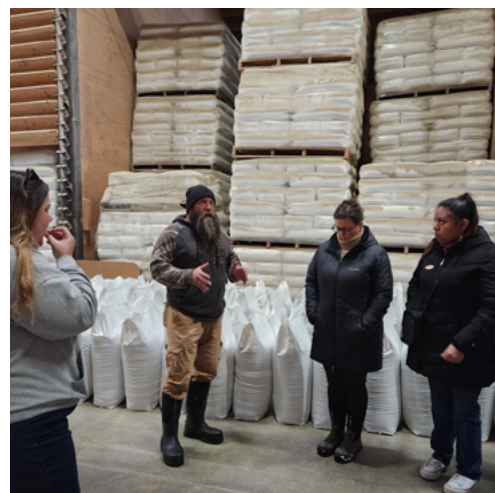
Obsidian Seed Tour

Central Oregon Chapter would like to thank everyone who braved the weather to join us for Convention 2024!