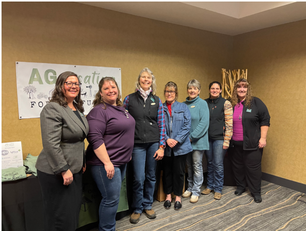
2024 Oregon Women for Agriculture State Officers