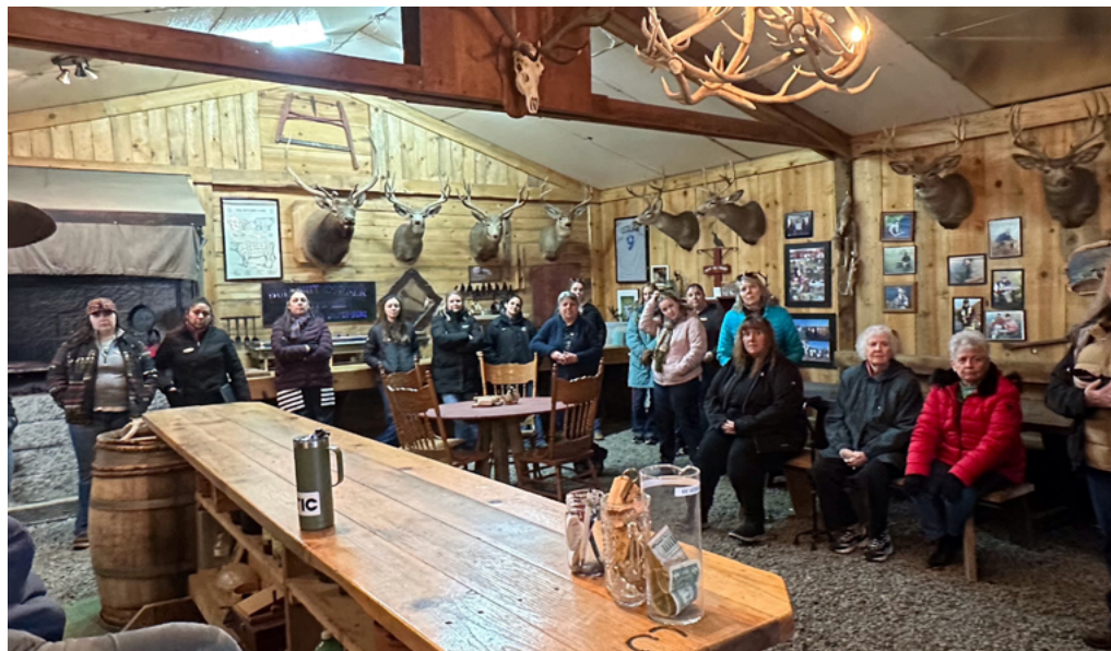
Gateway Canyon Preserve & Rocker 3 Ranch

educating the public on Farm to Fork Operations and how to collectively preserve water for our ecosystems, endangered species, and farmland. Along with that they have partnered with Western Justice Legislative Fund to help fight Central Oregon's water battle. To find out more about these organizations check out their websites: www.perfectbalanceusa.org ; www.westernjustice.info .