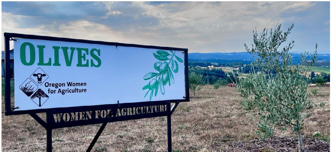
A unique crop identification sign placed in Washington County!

630 Hickory Street NW, Suite 120: PMB Albany, OR 97321 www.owaonline.com