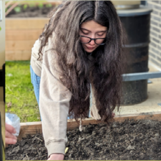
Clubs and Youth Programs