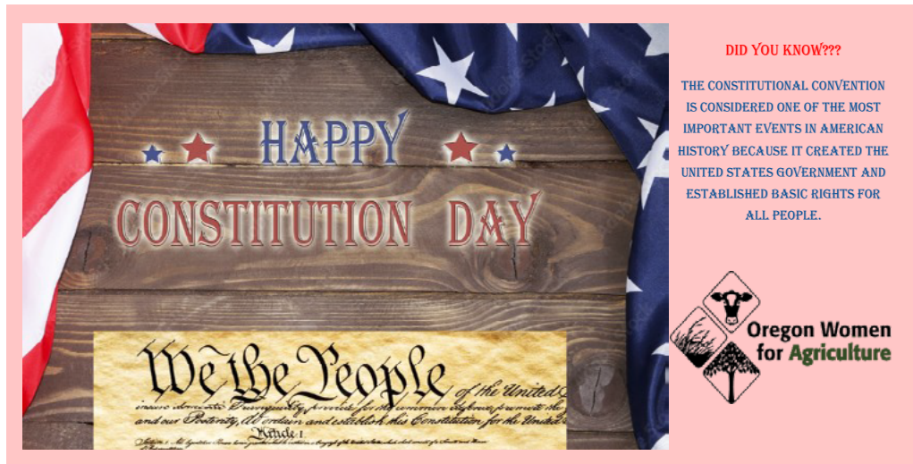
Part of the newspaper spread which celebrated Constitution Day in the Polk County Itemizer-Observer.

As the cooler months approach, LBOWA looks forward to continuing