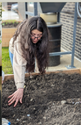
Clubs and Youth Programs