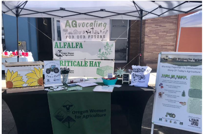
Central Oregon Chapter's First Thursday booth in Madras.

First Thursdays in Madras started back up in May and continues through September. We have expanded our booth to have trivia questions along with ag related treats, stickers and information about Oregon Ag.