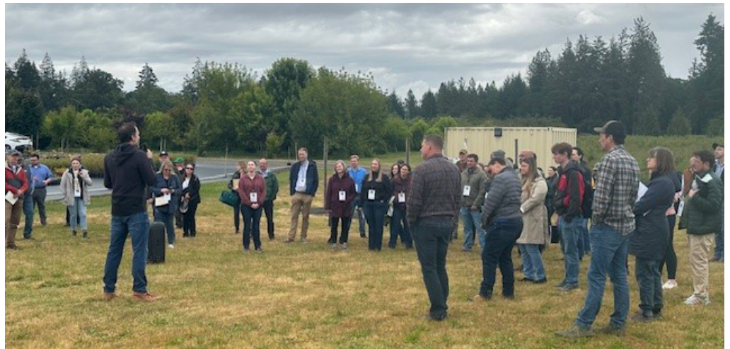
The AG-PAC tour at Oregon State University's Lewis Brown Research Farm. The tour, hosted by AG-PAC is geared towards both current elected officials and candidates.

There is a new Initiate Petition (IP) that is likely to make the November ballot – IP 17. Signatures are due July 5, so we will know the results soon. IP 17 is basically a gross receipts tax that redistributes income. For companies with Oregon sales above $25 million, the new corporate minimum tax would be the existing schedule plus a new 3% tax on sales above $25 million. All money raised would be allocated to people living in Oregon for at least 200 days, including children.