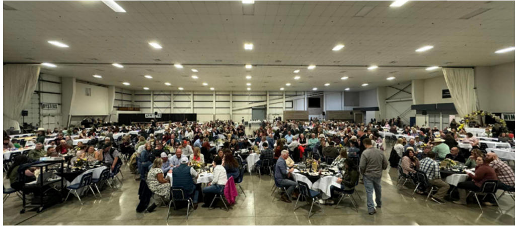
Attendees gather at the 2024 Oregon Women for Agriculture Dinner and Auction.

The auction was a great success raising over $129,000. Thank you to all the people who showed up and made it such a successful year. Personally, I want to thank the OWA