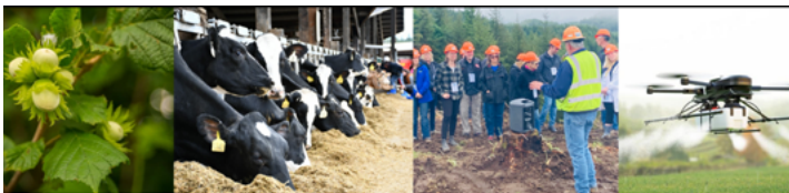
SAI participants at tour stop Rock'n D Ranch in Junction City. Teachers from multiple disciplines and grade levels participated in the week-long program.