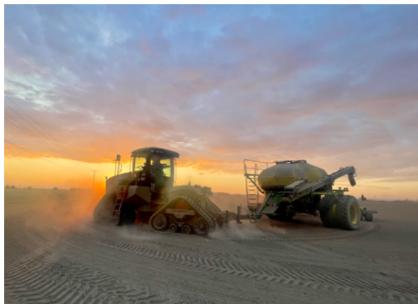
2024 Photo Contest Winner

Do you take lots of pictures of your farm, animals, and crops? Then OWA has a Photo Contest for you! Submissions are due November 1, 2024. There are small prizes for the top 3 ag related photos received. One photo per person. Photos should be a high quality jpg format and no smaller than 1600 x 1200 pixel size. Send your entries to Kristi Miller millerk@dswebnet.com