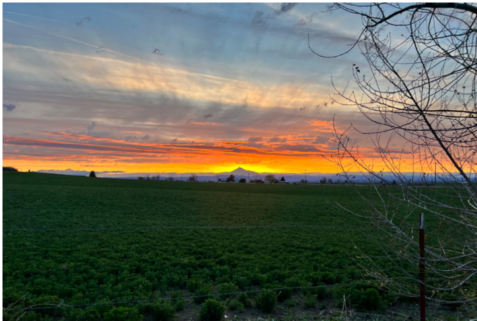
3rd place OWA photo contest entry.

45-minute presentation via Zoom on a topic affecting agriculture! Stay tuned, but plan on joining in!