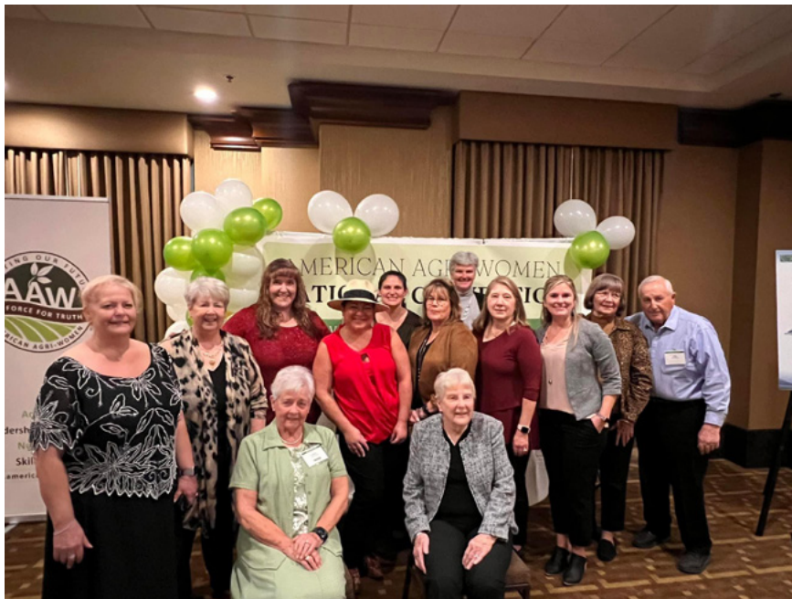
Oregon Women for Ag members and guests in attendance at National Convention

The American Agri-Women national convention was held in Sacramento during the first week of November. It was a gathering of women from across the country, coming together to learn from each other, discuss issues, and network. Engaging speakers, educational tours, and lots of great conversation rounded out the week. OWA had 12 members in attendance! Tours were to the Bayer Crop Science Vegetable R&D facility, the Center for Land Based Learning, and Turkovich Family Wines.